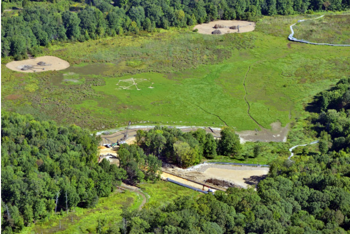
Wetlands viewed from above during construction.